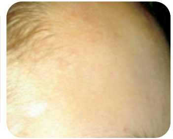
After Vibraderm Tx